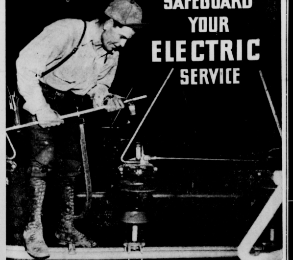
Lightning is the most frequent cause of interruption to electric service. Above, Lineman K. O. Shoulders replacing a fuse blown by lightning on the top of a 66,000 volt substation.

• Clambering up a substation structure on a dark, rainy night is no child's play. Duties such as this call for cool heads and skilled hands.