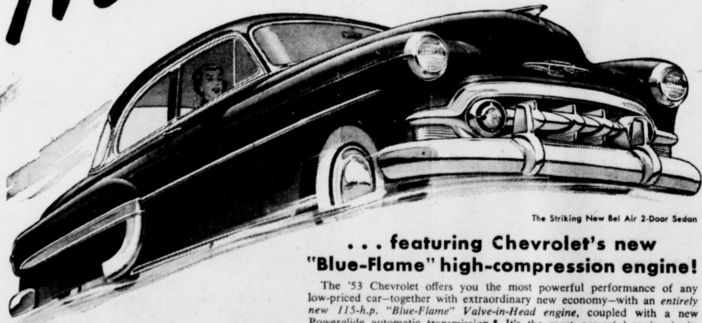
The Striking New Bel Air 2-Door Sedan

... featuring Chevrolet's new "Blue-Flame" high-compression engine!