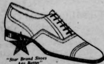
"Star Brand Shoes Are Better"

All the latest styles for Men, Women and Children.