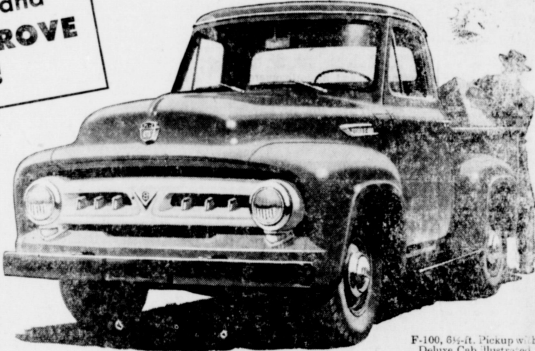
F-100, 6 1/2-ft. Pickup with Deluxe Cab illustrated

They're here! Over 190 completely new Ford Truck models, in a tremen- dously expanded line! Pickups to 55,000-lb. G.C.W. Big Jobs! Ford Trucks are completely New from cab to axles— with a wealth of new time- saving features to GET JOBS DONE FAST!