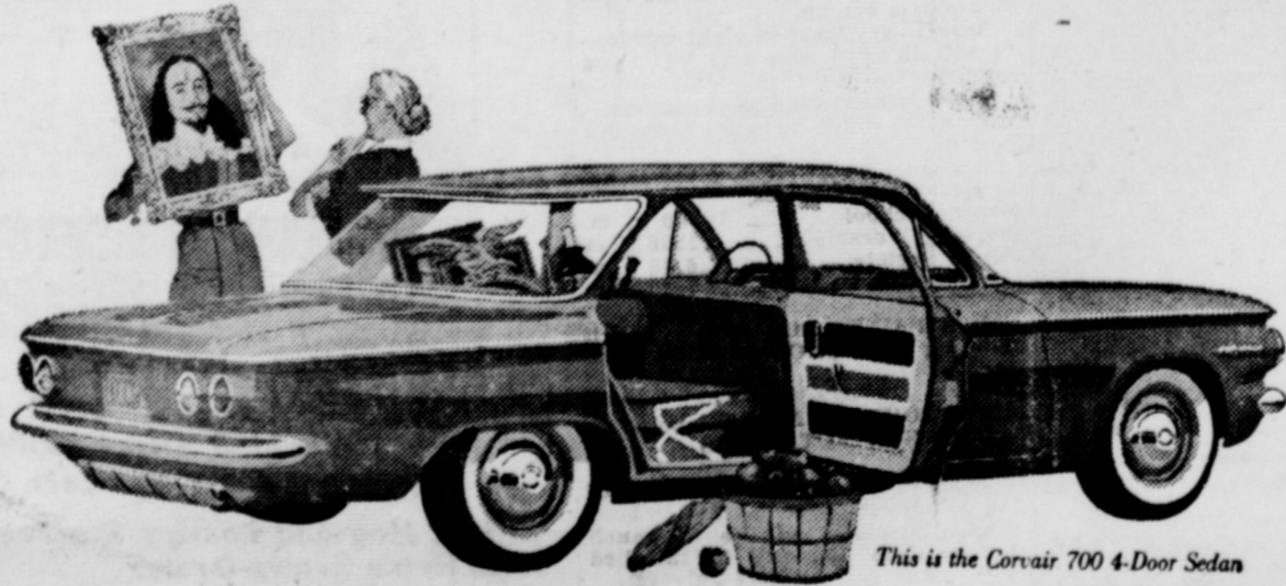
This is the Corvair 700 4-Door Sedan

For economical transportation— corvair BY CHEVROLET