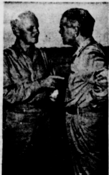
Chiefs of staff conferring aboard a warship in the South Pacific. Adm. Chester W. Nimitz, USN, (left) Commander in Chief, Pacific Fleet, and Adm. William F. Halsey, Jr., Commander, South Pacific Force.

In a letter to all Texas 4-H Club members the Governor said, "Please accept my best wishes for 1960 and the years ahead. May you continue to build yourselves, your homes and communities, and thus help build our State and Nation. The future holds bright promise for our land, and you as 4-H Club members have a vital share of this future. I join the people of Texas in saluting you and the parents, adult leaders and friends of 4-H who make this program possible."