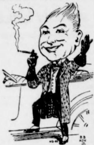
"If wishes were automobiles, gasoline would be worth a million dollars a gallon."