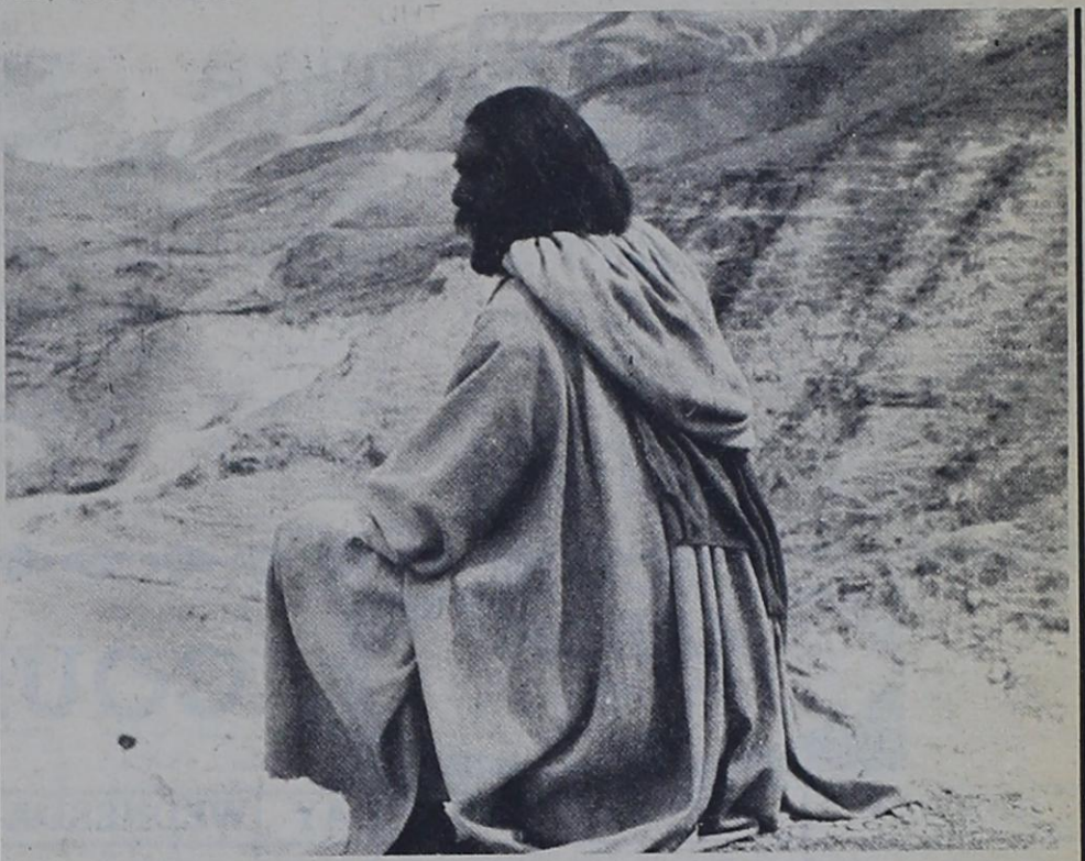
THE ART OF DOING GOOD

Wouldn't it sound funny if the Bible said Jesus "went about being good"? Instead it says "He went about doing good."