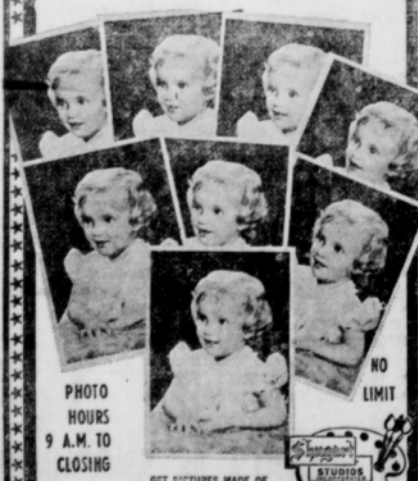
PHOTO HOURS 9 A.M. TO CLOSING

FREE SPECIAL BONUS THIS TIME ONLY 1 - 3x5 9 MIDGET SIZE WITH PURCHASE OF OUR REGULAR SPECIAL 8 KING SIZE WALLET TOTAL OF 18 PICTURES FOR 99c