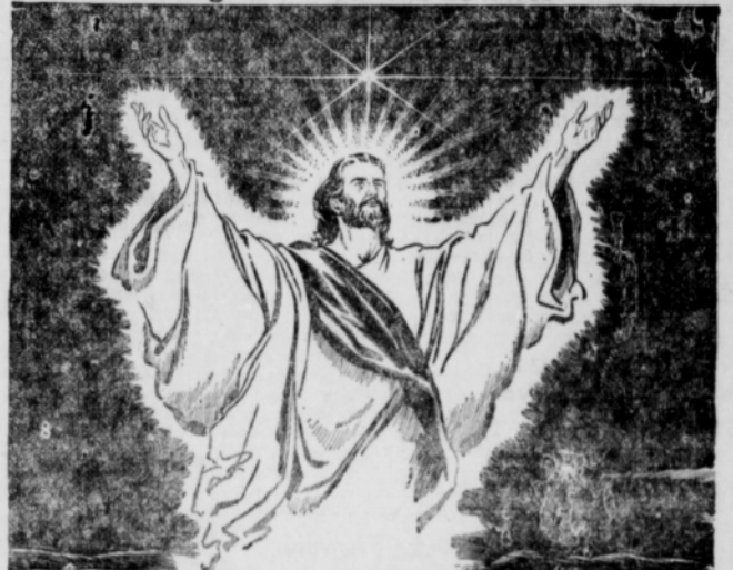
"King of Kings and Lord of Lords" REV. 1916