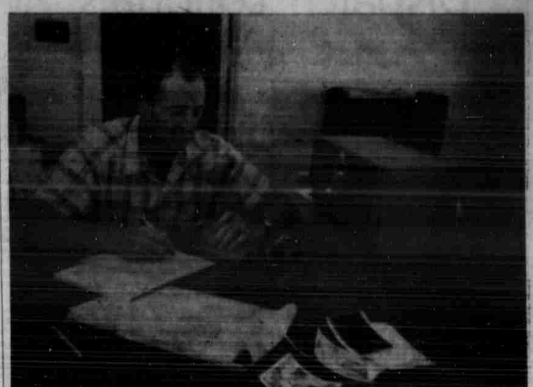
POLICE RADIO IN NEW LOCATION

It was the moving of the equip-ment by the county from the sheriff's office to the new quarters that triggered the "storm"-now apparently blown over.