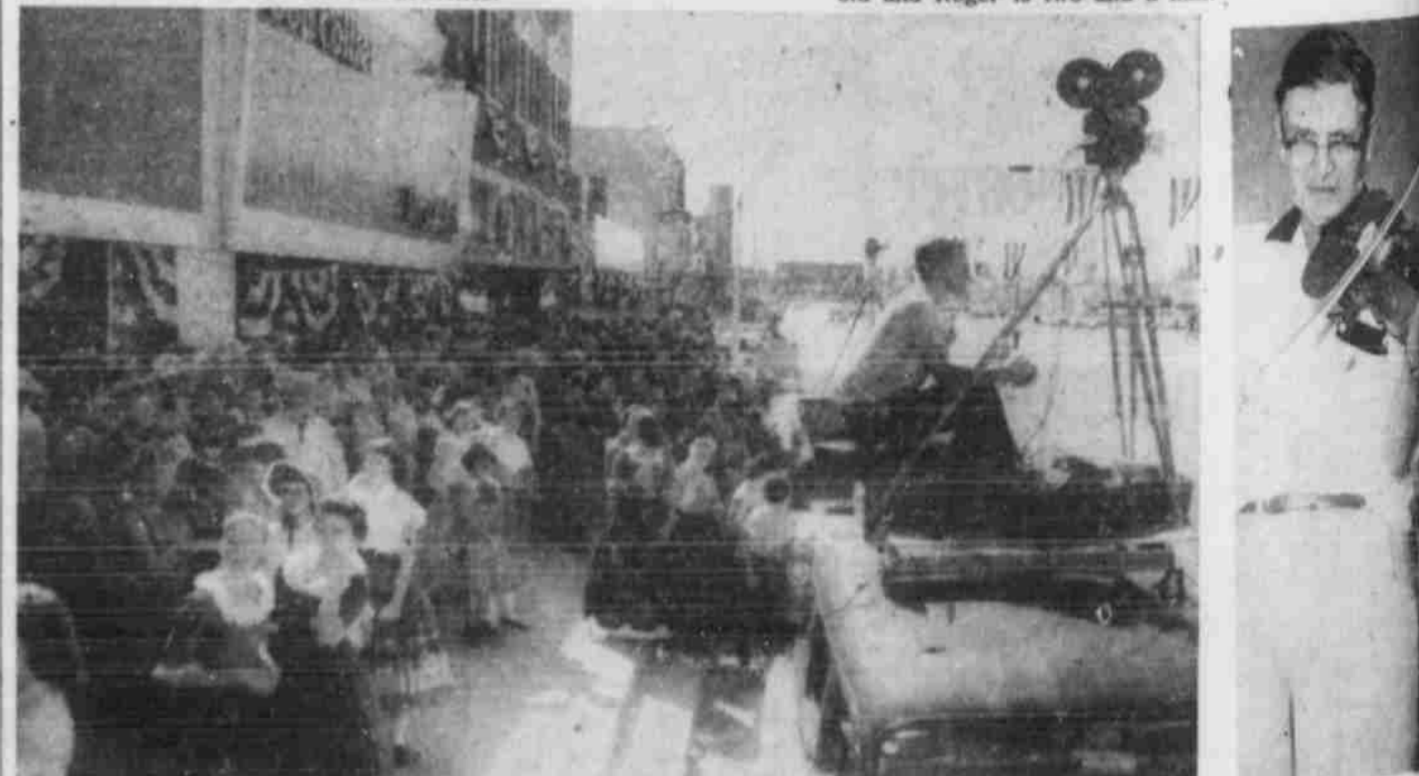
SECTION OF PARADE CROWD — While a television cameraman waits patiently, hundreds of people mill around on the south side of East Main, eager for the big parade to get under way.