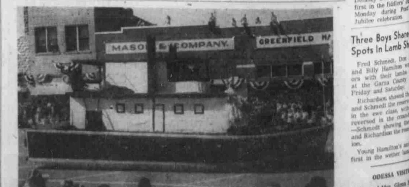
SOUTHLAND ENTRY — Southland, in northwestern Garza County, was one of the communities entering floats in the parade. The float represents a river boat, cotton and other products typical of the "Southland." It is also graced by Southland's princess.