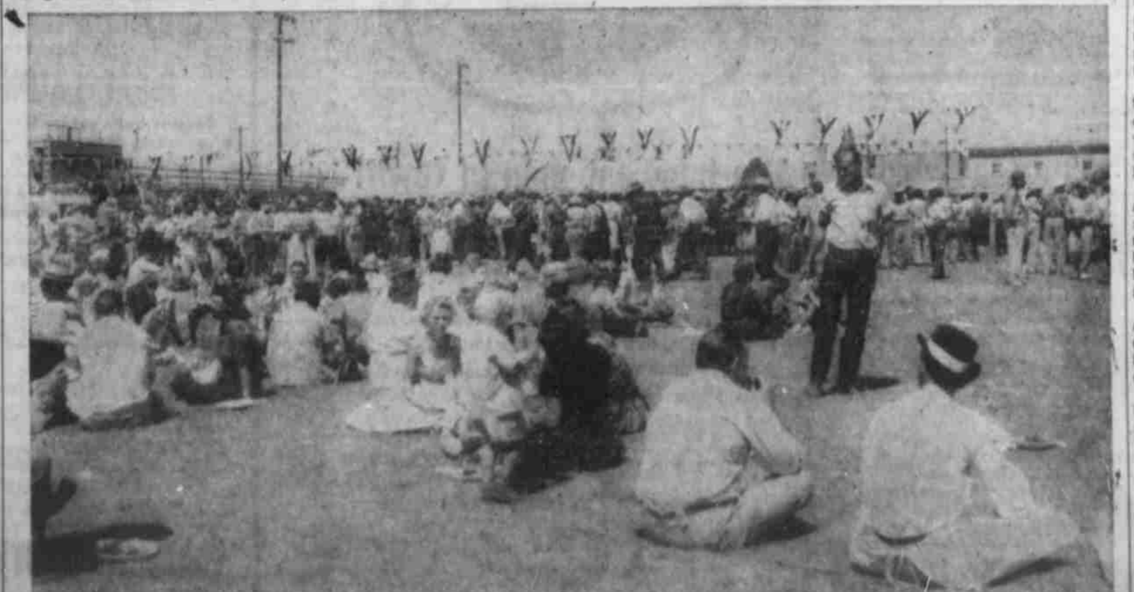
CROWD GATHERS FOR BARBECUE — This is a part of the crowd of approximately 4,000 who gathered Monday for the barbecue at Antelope Stadium. The special guests' tent can be seen in the upper center of the picture.