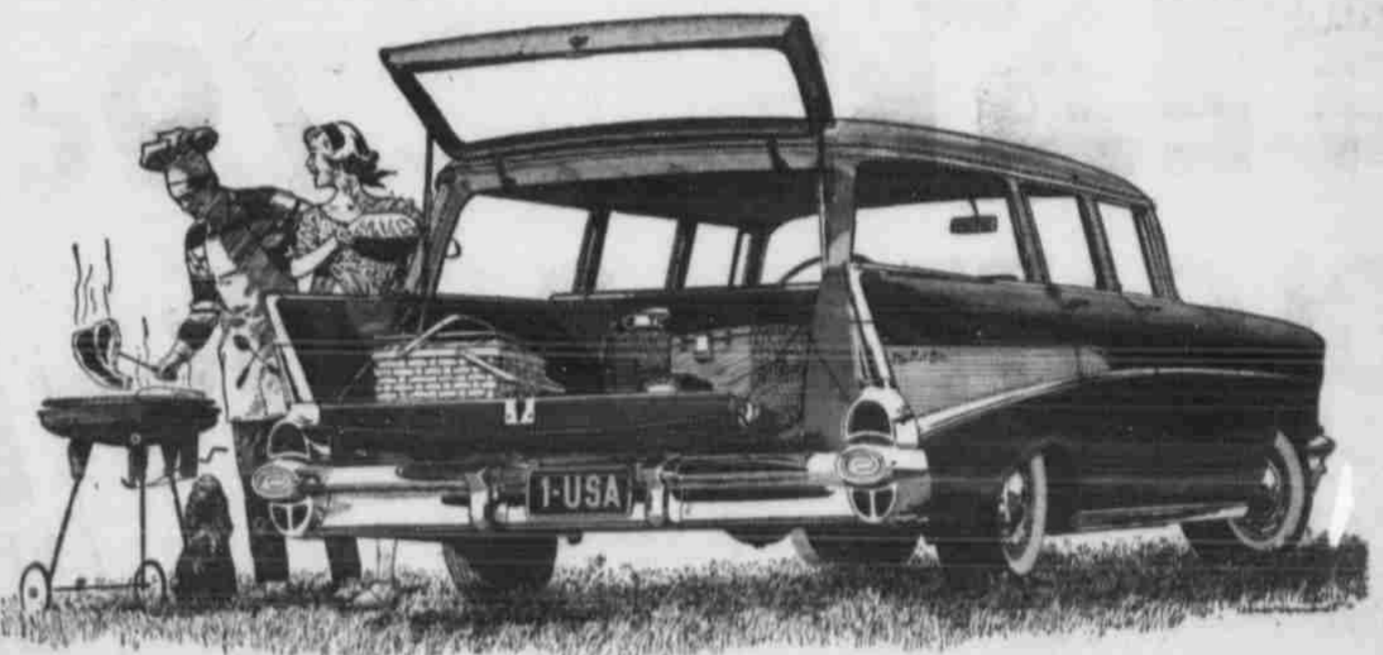
New Chevrolet station wagons have Body by Fisher, of course. Above, the Bel Air 4-door Townsman.

They're eager-beaver beauties... these Chevrolet wagons!