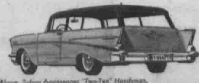
Above, 2-door 6-passenger "Two-Ten" Handyman.

See Your Local Authorized Chevrolet Dealer