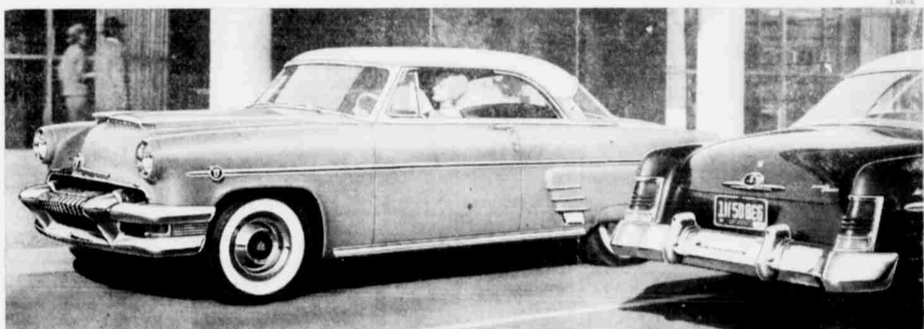
IN EVERY MODEL, AN ENTIRELY NEW 161-HP V-8—Mercury offers you the same high horsepower engine even in the lowest priced model, at no extra cost.