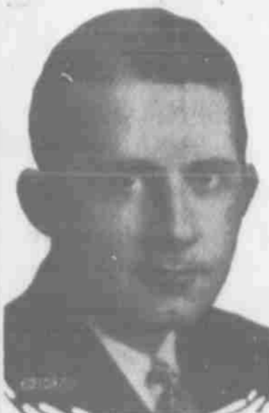
ALLAN SHIVERS of Jefferson County

Sensor Allan Shivers will officially open his campaign for lieutenant governor in Fort Arthur, Thursday, June 27. Dean of the Texas Senate and World War II overseas veteran, his speech, which will be broadcast over the Texas Quality Network, 8 to 8:30 p. m., will be of interest to every voter in Texas.