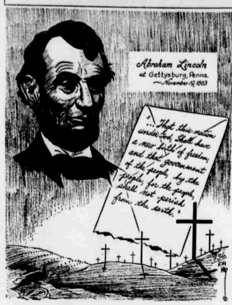
This Nation Under God