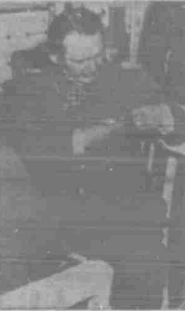
Signal Corps Radiophote

GERMANY — Soundphoto — Reich Air Marshal Hermann Goering, former Nazi, 2, of the master race, who surrendered to the 7th Army forces, arrives for detention at camp in Augsburg, Germany. Here Goering removes his many medals during process of entering prison camp.