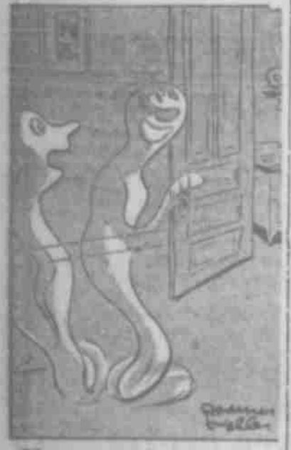
"Come out into the kitchen while I stare up some Wheaties."