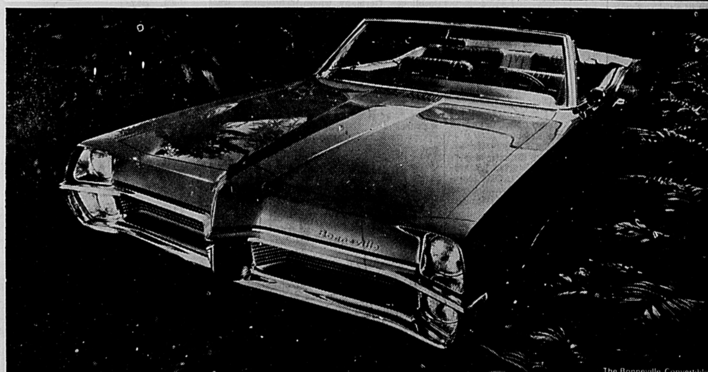
The Wide-Track Winning Streak starts at your authorized Pontiac dealer's.