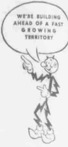
No. 79 of a series of advertisements designed to help build this fast growing territory in which we serve.

To business men, low cost electric power means more and better business. Take good lighting for instance. Good lighting displays merchandise better... customers can see better what they buy. Our vast expansion program is helping business grow in the territory we serve. There is an abundance of power for everyone, including homes, farms and industries.