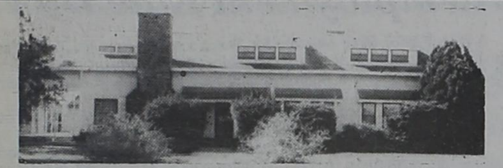
HUDMAN FUNERAL HOME

204 E. Main - Post, Tx. 79356 Call 495-3050, 3051 for All forms of insurance