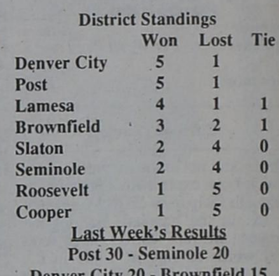
Denver City 20 - Brownfield 15 Lamesa 46 - Slaton 19 Cooper 30 - Roosevelt 14

Order your subscription today! ONLY $15 in Garza and adjacent counties! Call 495-2816