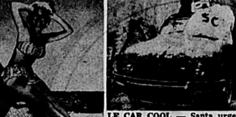
FIRE INJUN — Cookie Dwyer sizes in brief Indian-motif swim suit at Miami Beach.