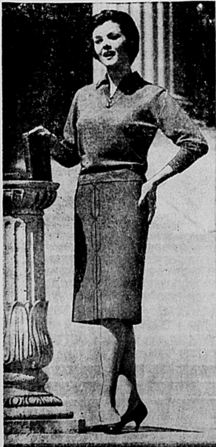
As shown in Mademoiselle

Donovan-Gabriani Chic Style at Working Girl Prices