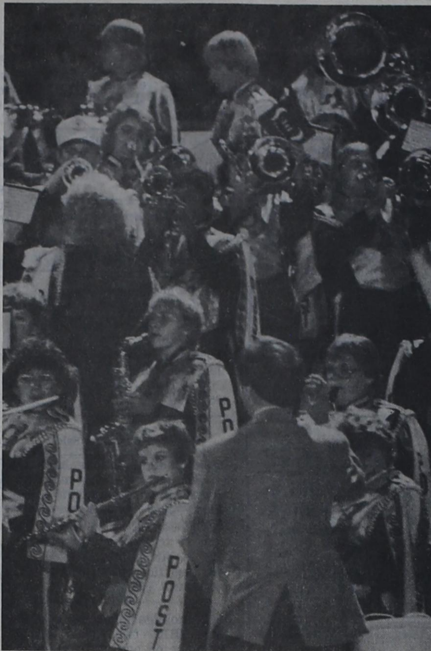
POST BLACK AND GOLD BAND - Members of the Post High School band perform during fourth quarter action at Roosevelt last Friday night. The band will participate in the marching contest at Jones Stadium this Saturday. At press time an exact marching time had not been announced.

The junior varsity hosts the Anton Bulldog varsity in a contest here Thursday at 7:30 p.m.