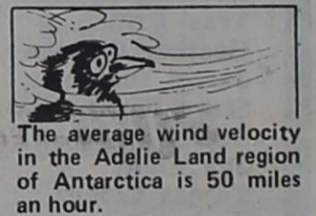
The average wind velocity in the Adelle Land region of Antarctica is 50 miles an hour.