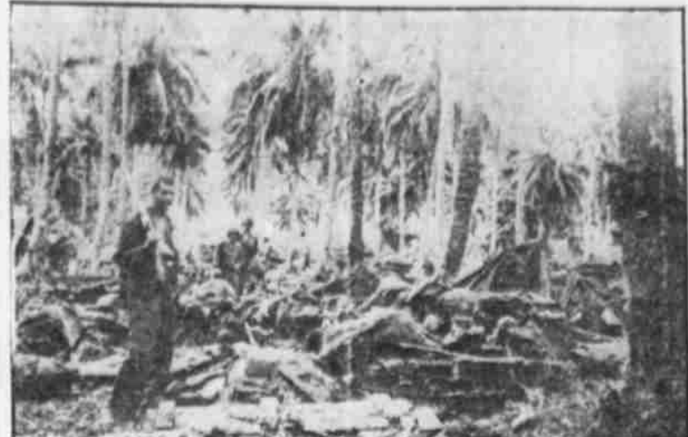
RENDOVA FIELD, SOLOMONS (Soundphoto) - This soundphoto shows wreckage of an army field headquarters kitchen, left when the Japs came over Rendova Island, during the preparation of a meal. One man was killed when the enemy scored a direct hit in the recent raid.