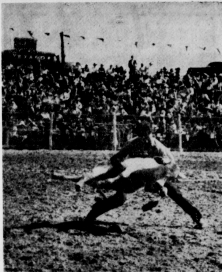
A scene from the calf roping contest held at the Dublin Rodeo. The Eighth Annual Pre-Madison Square Garden World's Championship Rodeo will be held in Dublin, Texas, September 4, 5, 6 and 7. Gene Antry will be present for the performances on Thursday, Friday and Saturday nights. Special acts for the Madison Square Garden Rodeo will gather at Dublin to participate in the rodeo there before going to New York City.

to an open case is by tuberculin testing. This simple test is not a protection against TB, but it does tell whether the germs have entered the body. A small amount of tuberculin is injected into the skin through a tiny needle, as in the Mantoux test, or a tuberculin-treated patch is placed on the skin, as in Vollmer's patch test. If the skin at that point shows a red, raised reaction within a few days, the germs are present, either in an active or inactive form. If the tuberculin test is positive, the doctor will immediately follow up with a chest X-ray and other tests to determine whether the germs have taken hold. A healthy child will usually fight off the germs in his body and the disease will not develop. But if resistance is feeble, due to generally poor health, or if the germs are attacking constantly and in large quantities, tuberculosis may result. It must be remembered that a child with a negative test today may have a positive reaction