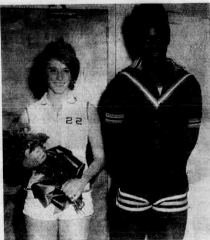
CAGE SWEETHEART, BEAU