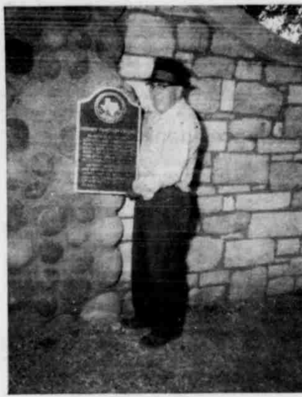
CEMETERY GATE MARKER

The council met Tuesday night instead of Monday because of the Labor Day holiday.