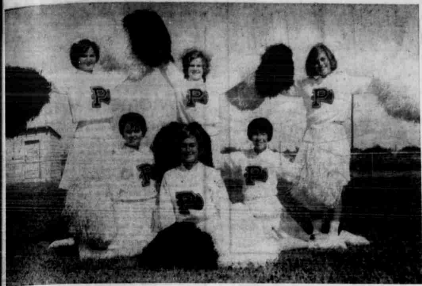
SIX CHEERLEADERS HEAD POST PEP SQUAD

The sermon subject at the 11 a. m. service will be "He smothered the Serpent!" The Lord's Supper will also be observed.