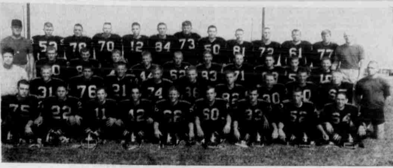
ANTELOPES PLAY FIRST HOME GAME FRIDAY NIGHT