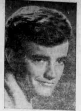
MR. PULVER Affable Robert Walker stars in the name-role of "Ensign Pulver," showing Sunday, Monday and Tuesday at the Tower Theatre.