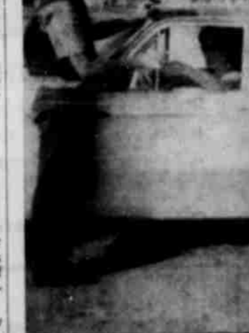
JAYCEE REST STOP BUSY