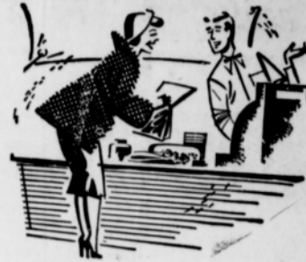
MR. MERCHANT—HERE IS OUR ADVERTISING MESSAGE FOR YOU

A handful of baking soda put in the sink overnight will clean and purify the unfragrant drain.