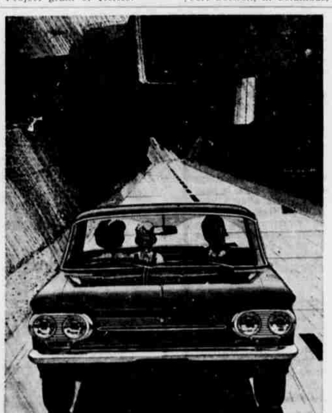
Monza Spyder Club Coupe

Come hill... or high water Vacations go smoother in a Chevrolet Corvair