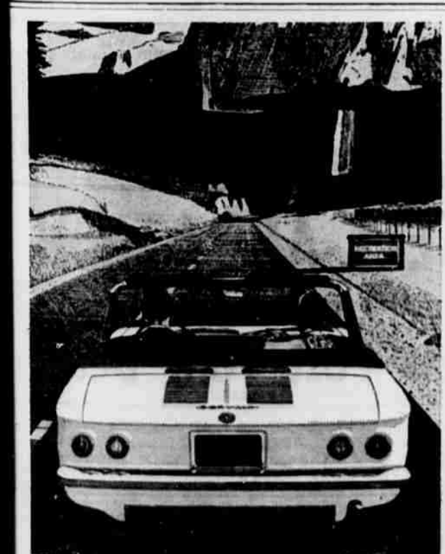
Monza Spyder Convertible

The Garza Medical & Surgical Clinic WILL BE CLOSED Week of June 8-15 for Vacations for Entire Staff Business Office Will Be Open 9 to 11 a. m.