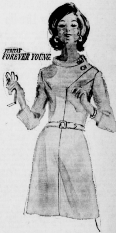
Style No. 8401 — Style No. 9401

ROY & SUE GOIN 1 Mile South and 1 Block West of Clyde On Old Baird Highway, Ph. 893-4468