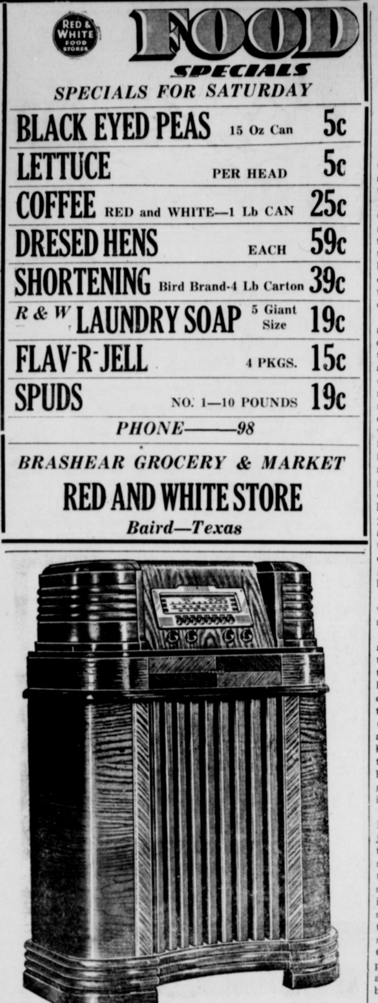
This beautiful PHILCO Radio for $79.95 and your old Radio - Terms as low as $1.35 Per Week