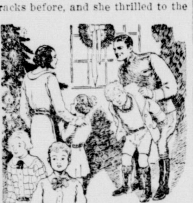
He Was Taking the Coat Off a

Tousle-Headed Boy. ride over the snowy road, but she more fascinated by the children