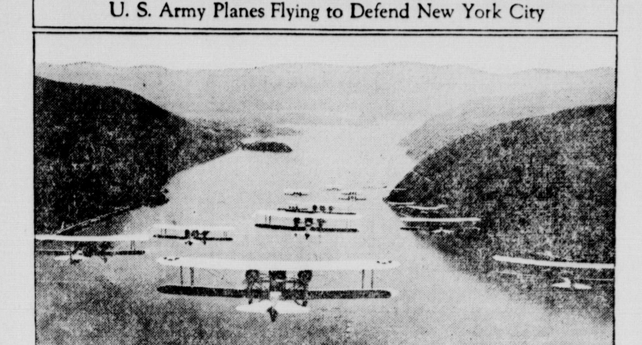
A few of the 600 flying machines which flew down the Hudson River to the "defense" of the metropolis are shown just after they passed West Point. Ten years ago the highlands shown above were considered highly dangerous, because of air pockets, by fliers.

Magnesia—just a tasteless dose in wall is pleasant, efficient and harm It is the quick method. Results calmost instantly. It is the appromethod. You will never use and