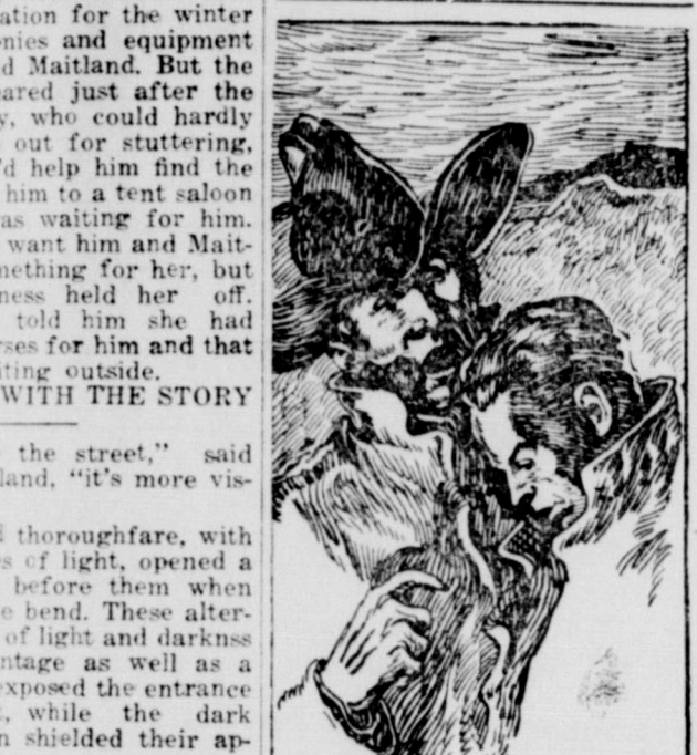
"The man wouldn't believe that I didn't have a gun notched for

Clouds billowing darkly on a chill wind, shadowed the crests of drizzle, he discerned a dark lifethe swing doors. Lake—first promise of their apdows that flickered over from the shuffle of Yukon. The sky turned grayer as In answer to his shout, et, they moved safely they descended, till it melted in flakes that drifted around them es to show-" Speed like leaves, mantling their mud-