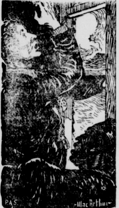
A gun crashed as his foot touch-