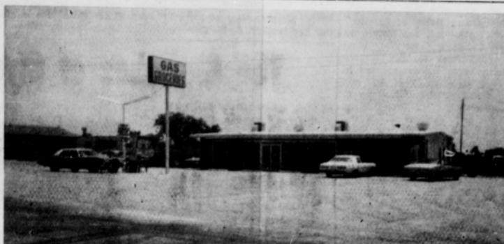
Grand Opening Saturday of the newest added attraction to the City of Baird - Big Country Drive-In Grocery, I-20 and South Access Road.