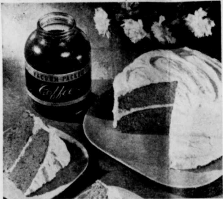
Both batter and frosting are made with coffee in new cake recipe.

Coffee, which continues to be- baking powder, 1/2 t. salt, 3/3 c. ome more popular as America's shortening, 1 c. sugar, 3 eggs, 1/2 t. favorite hot or iced drink at all vanilla, 1/2 c. cold strong coffee. hours of the day, is one of the Sift flour. Measure and sift tofinest flavorings for desserts.