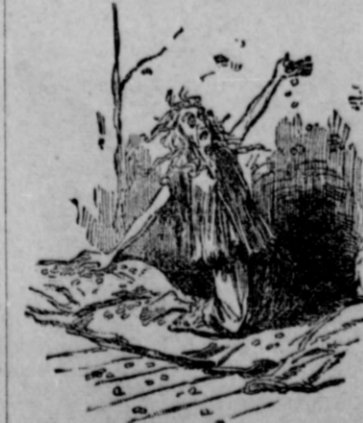
"I Sold My Soul for It."

"Fitzgerald" gasped Moreland, growing pale. "—what's that?" he shrieked, as he saw Whyte's coat, all weather-stained, lying on a chair near him, and which he immediately recognized. "That is the rope that's going to hang you," said Kilsip, quietly, coming behind him, "for the murder of Oliver Whyte." "Trapped, by G—!" shouted the wretched man, wheeling round, so as to face Kilsip. He sprang at the detective's throat, and they both rolled perfectly on the floor, but the letter was too strong for him, and after a sharp struggle, he succeeded in getting the handcuffs on Moreland's wrists. The others stood around perfectly quiet, knowing that Kilsip required no assistance. Now that there was no possibility of escape, Moreland seemed to become resigned, and rose sullenly off the floor.