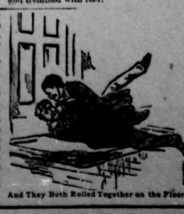
And They Both Rolled Together on the Floor.

"Fitzgerald" gasped Moreland, growing pale. "—what's that?" he shrieked, as he saw Whyte's coat, all weather-stained, lying on a chair near him, and which he immediately recognized. "That is the rope that's going to hang you," said Kilsip, quietly, coming behind him, "for the murder of Oliver Whyte." "Trapped, by G—!" shouted the wretched man, wheeling round, so as to face Kilsip. He sprang at the detective's throat, and they both rolled perfectly on the floor, but the letter was too strong for him, and after a sharp struggle, he succeeded in getting the handcuffs on Moreland's wrists. The others stood around perfectly quiet, knowing that Kilsip required no assistance. Now that there was no possibility of escape, Moreland seemed to become resigned, and rose sullenly off the floor.