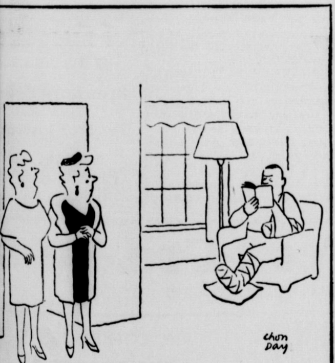
"OH, HE WAS DRIVING A VERY SMALL CAR AND HE HIT A VERY BIG PEDESTRIAN."