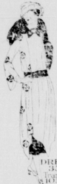
DRESS 3546 Transfer $10.50 DESIGNER PATTERNS THE BELROBE A NEW PATTERNS DEPARTMENT OF THE R. B. EDWARDS CO.

Mean the Smartest Wardrobe You Have Ever Had