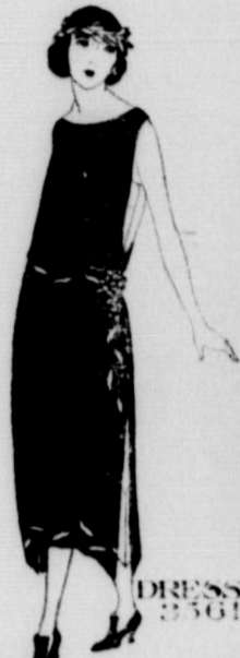
DRESS 3561 DESIGNER PATTERNS THE BELROBE A NEW PATTERNS DEPARTMENT OF THE R. B. EDWARDS CO.

3 It give you Paris' own touch in finish—those all-important things upon which the success of your gown depends.