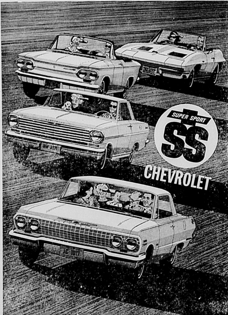
Pictured from top to bottom: Corvette Sting Ray Convertible, Corvair Monza Spyder Convertible, Chevy II Nova SS Coupe, Chevrolet Impala SS Coupe. (Super Sport and Spyder equipment optional at extra cost.)

seats. It even offers a new Comfortilt steering wheel* that positions right where you want it. The new Chevy II Nova SS has its own brand of excitement. Likewise the turbo-supercharged rear-engine Corvair Monza Spyder and the all-new Corvette Sting Rays. Just decide how sporty you want to get, then pick your equipment and power—up to 425 hp in the Chevrolet SS, including the popular Turbo-Fire 409* with 340 hp for smooth, responsive handling in city traffic. *optional at extra cost