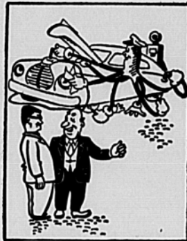
"Best doggoned service man I ever saw."

We have the "arms for service, too. Before you hit our driveway we're ready to help. Get the habit of driving in - REGULAR-LY.