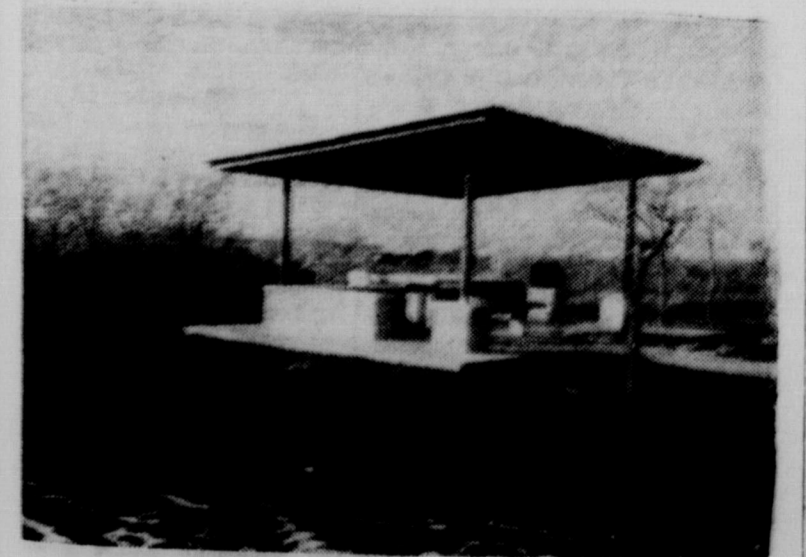
HOW ABOUT A PICNIC? —Although the weather has been a bit on the cool side lately to have a picnic, the Texas Highway Department is already preparing for warmer weather and has constructed two new picnic pavilions, like the one shown above, at the North Pocket Park.