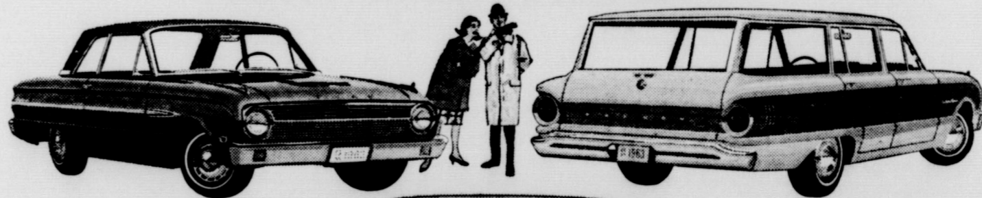
15 FALCONS—WITH THE FUN BUILT RIGHT IN!