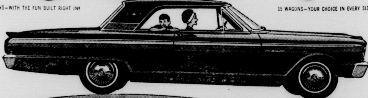
9 FORD FAIRLANES—THE HOT NEW MIDDLEWEIGHT!