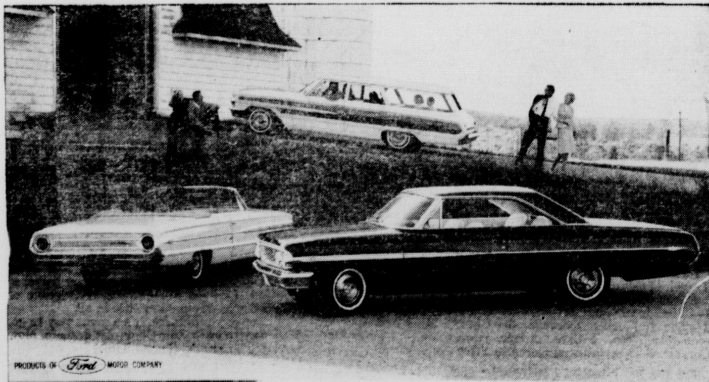
Left to right: Ford Galaxie 500/XL Convertible, Ford Country Squire, Ford Galaxie 500/XL Hardtop

Mustang - Falcon - Fairlane - Ford - Thunderbird