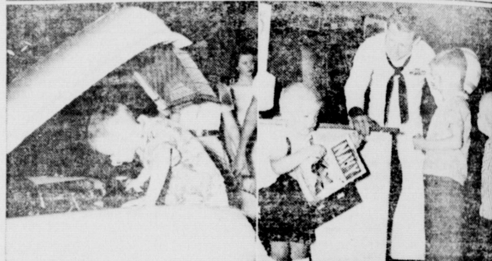
... To get the real inside story on the 1963 automobiles ... and to consider careers in America's nuclear-powered Navy.