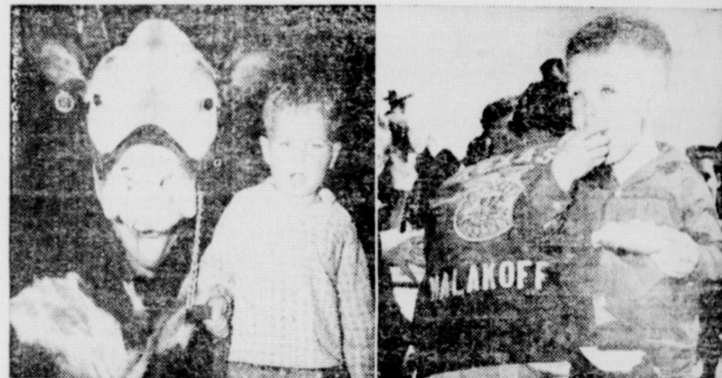
... To take a close-up look at the livestock business ... and to enjoy a sociable meal with some of the older men.