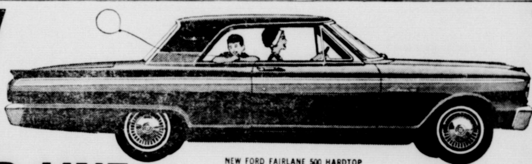
NEW FORD FAIRLANE 500 HARDTOP