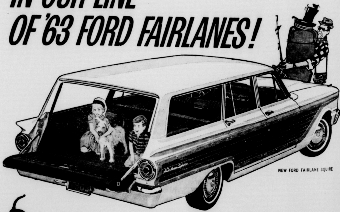
NEW FORD FAIRLANE SQUIRE

Only your Ford Dealer has 'em! Hot new middleweights with V-8 punch! New wagons! New hardtops! New sedans! New savings!