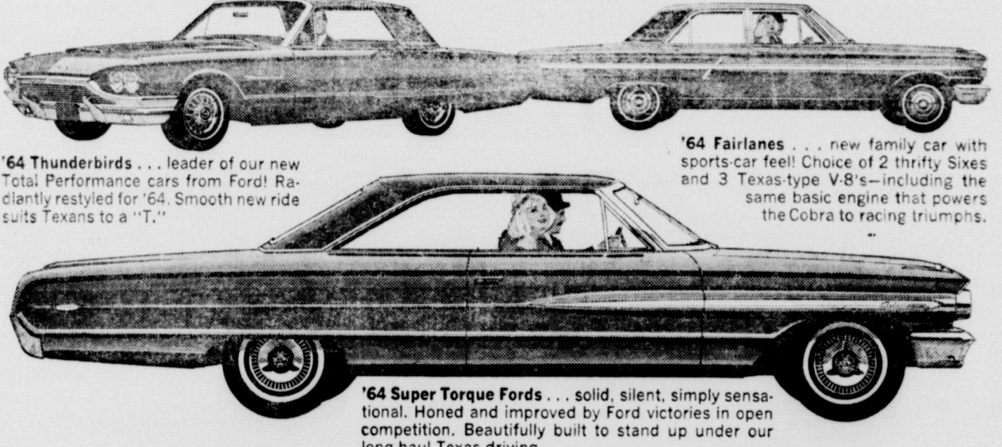
'64 Thunderbirds... leader of our new Total Performance cars from Ford! Radiantly restyled for '64. Smooth new ride suits Texans to a "T."