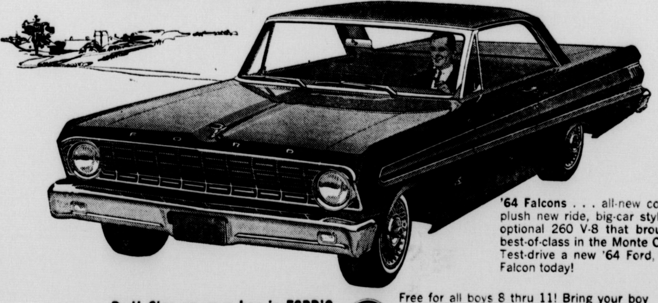
'64 Falcons... all-new compact with plush new ride, big-car style. Plus the optional 260 V-8 that brought Falcon best-of-class in the Monte Carlo Rallye! Test-drive a new '64 Ford, Fairlane or Falcon today!

A new line of born winners just rolled into Texas... the '64s from Ford!