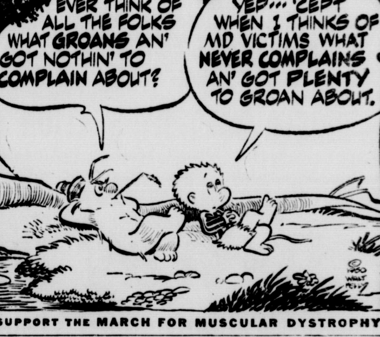
SUPPORT THE MARCH FOR MUSCULAR DYSTROPHY