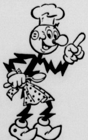
Reddy Kilowatt says: "Investigate the Reddy Wiring and Medal- lion Home remodeling plans sponsored by WTU. Remember, too... WTU customers can get free wiring (120 volts) for ranges, water heaters and dryers."

Now a modern electric dream kitchen can be yours through a loan from your lending agency... due to revision of the Title One FHA program! Now you can borrow the money to remodel your kitchen with electric built-ins, to bring beauty, convenience, time-saving, and the sheer pleasure of modern electric living! YOU can include: