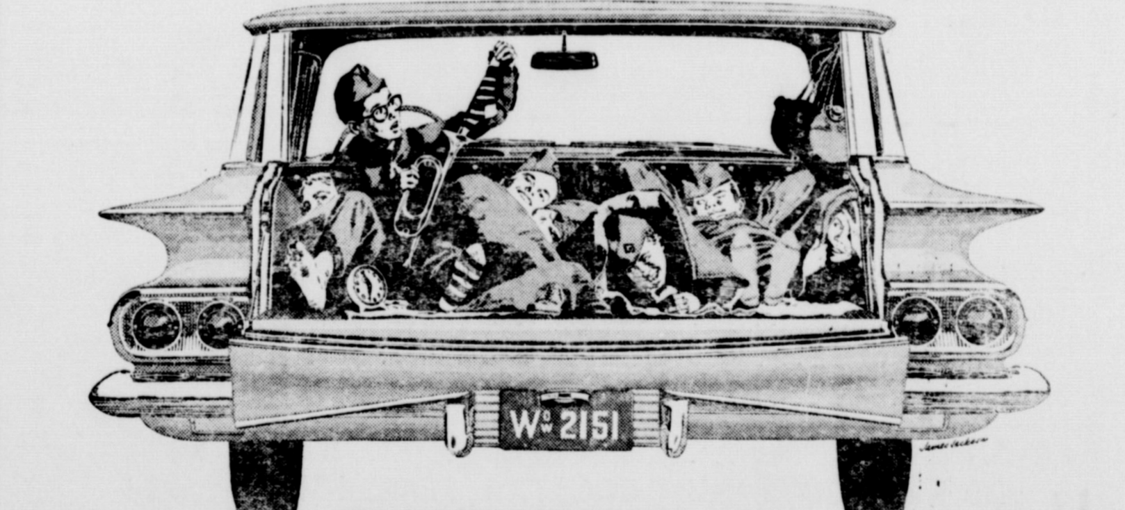
Air Conditioning—temperatures made to order—for all weather comfort. See The Dinah Shore Chevy Show in color Sundays, NBC-TV—the Pat Boone Chevy Showroom weekly ABC-TV

OPEN THE ONE-PIECE TAILGATE—SEE THE WIDE INSIDE DIFFERENCE IN A CHEVY WAGON!