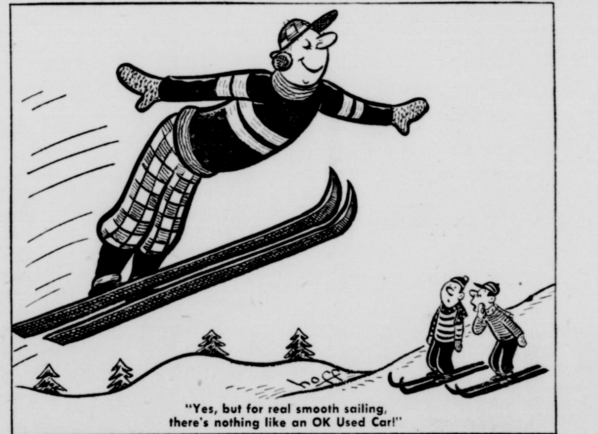
"Yes, but for real smooth sailing, there's nothing like an OK Used Car!"