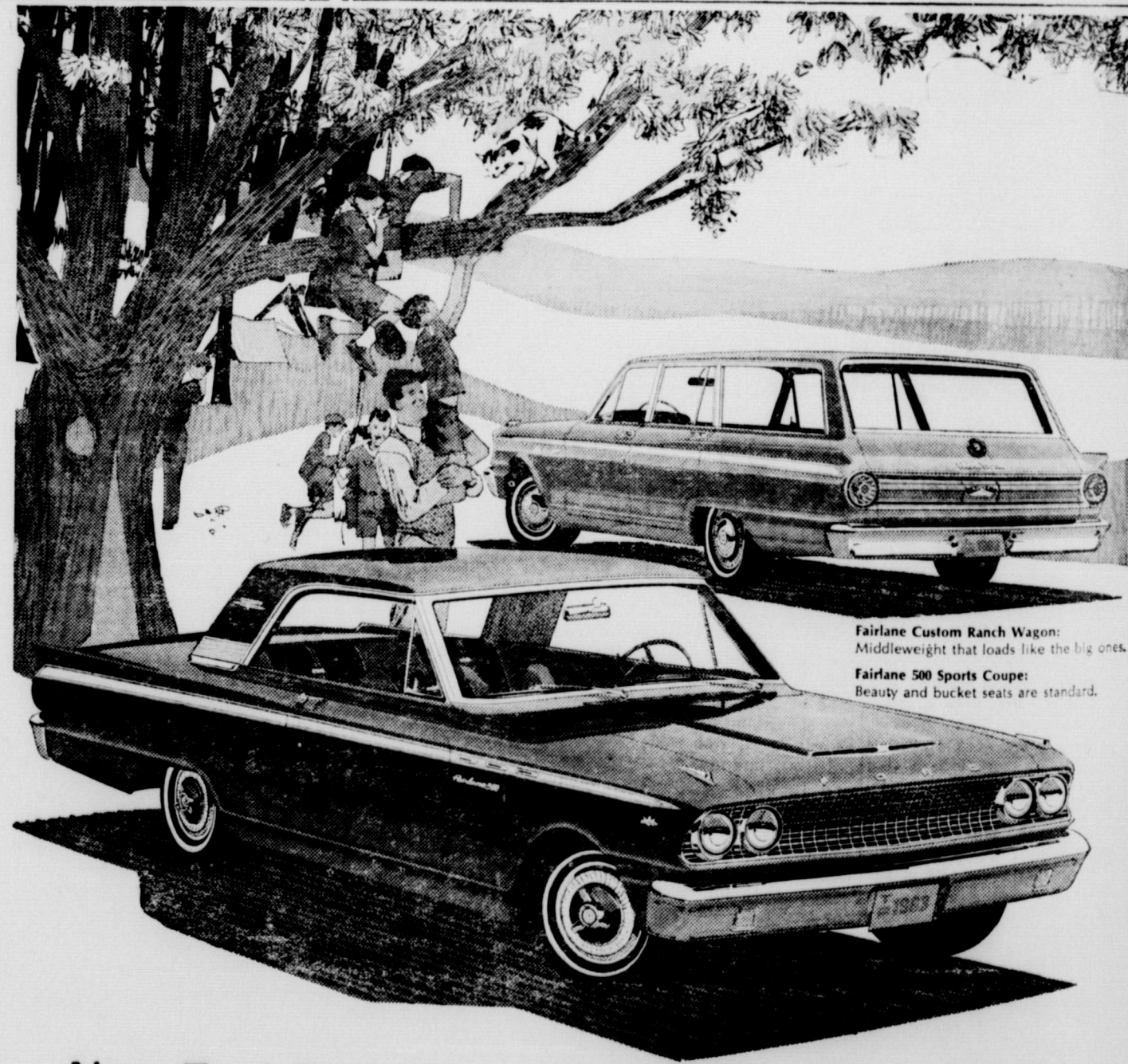
Fairlane Custom Ranch Wagon: Middleweight that loads like the big ones. Fairlane 500 Sports Coupe: Beauty and bucket seats are standard.

Now Ford Fairlane has hardtops and wagons!