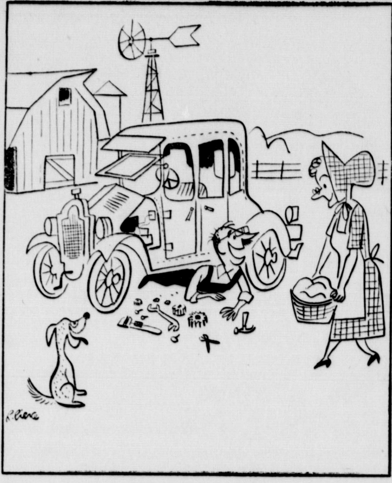
Good news, Ma! She's good for another trip to the State Fair of Texas, October 10-25, at Dallas.