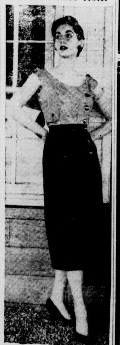
Utter simplicity is the keynote of these separates from Thelma Gay of Dallas. Proper placement of the large imported buttons down one side of the wrap-around skirt and on the sleeveless, scooped-neck blouse give trim functional finish. The fabric is Wm. Lind's Moonglow. Sizes 10-16.