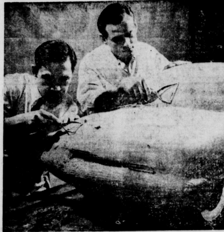
Ford Motor Company engineers and design stylists, such as this expert clay model team, work on the theory that to stand still in the auto industry is to move backwards. Today's research results in the finer cars America will drive tomorrow.