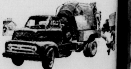
C-800 Series BIG JOB G.V.W. 23,000 lbs. G.C.W. 48,000 lbs.

Come in and see the new Ford Economy Trucks today!