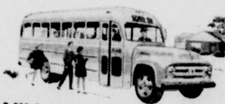
B-500 Series 154-in. wheelbase for up to 36-passenger bodies. With V-8 or Six.