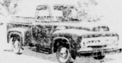
F-100 Series 6 1/2-ft. Pickup. Also 8-ft. Panel, 6 1/2-ft. Stake. 4800 lbs. G.V.W., 110-in. wheelbase.

Now! Choose the one right truck for your job from the all-new vastly expanded line of Ford Economy Trucks! Over 190 models!