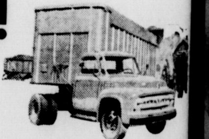
F-400 Series Tractor with Van Trailer. 16,000 lbs. G.V.W., 28,000 lbs. G.C.W.