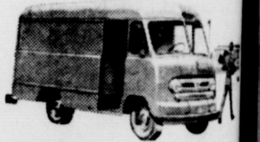
P-350 Series Parcel Delivery Chassis. Windshield front end for 7- to 11 1/2-ft. bodies G.V.W. 7,800 lbs.